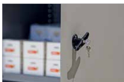
The doors include a lock with two keys.